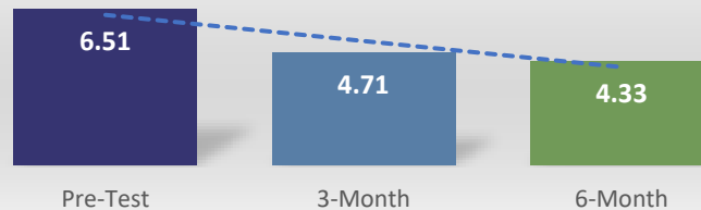
FY 2023 UCLA Scale Scores for RSI Pilot Projects in McLean County