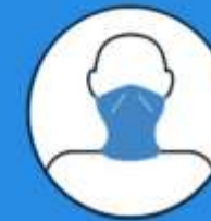
Neck Gaiter Braga de cuello