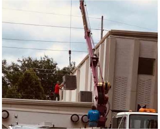
Thanks to a designated donation, we can now enjoy a cool gym!