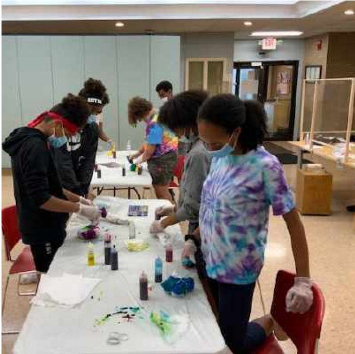
Tie-dye is back! Our teen girls enjoy a great afternoon showing their creative side.

With your help, we are able to move forward with our services