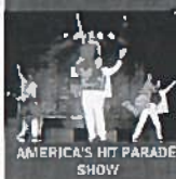
AMERICA'S HIT PARADE SHOW

4 DAYS 5 NIGHTS PER PERSON, DOUBLE OCCUPANCY (Mon - Sat) Sep 30 - Oct 5 2019